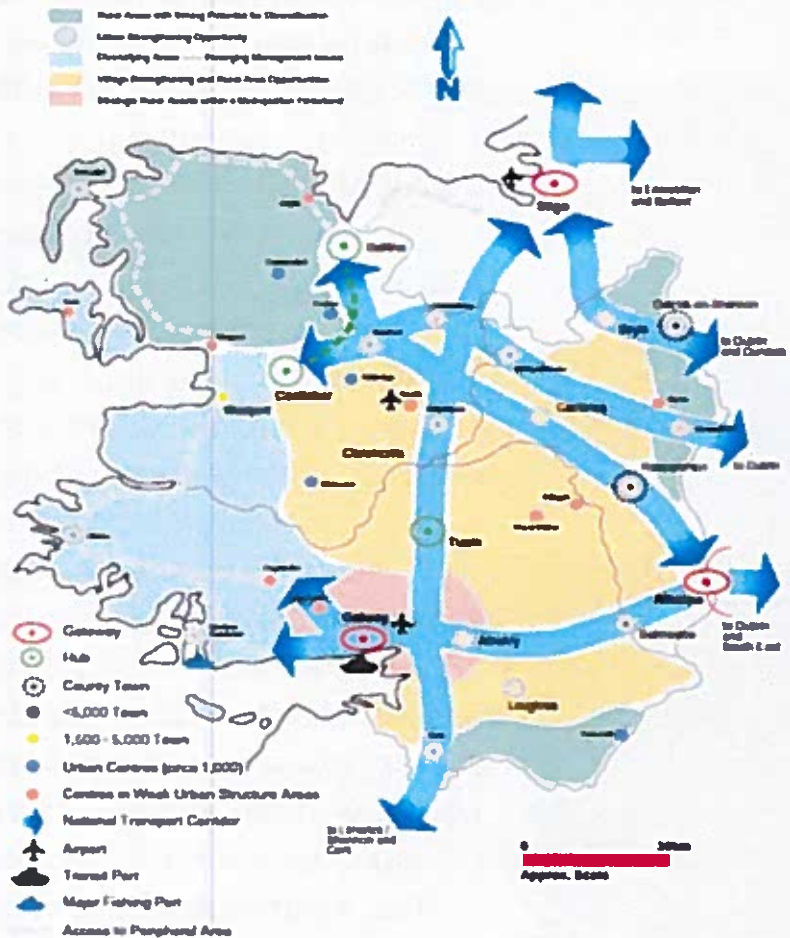
Map 10 West Region